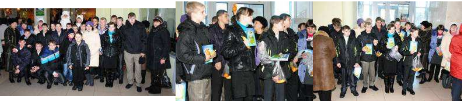
The Program represented in the Tsvetovo orphanage.