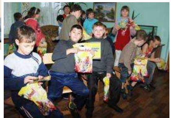
The Program represented in the Lachinovsky orphanage.